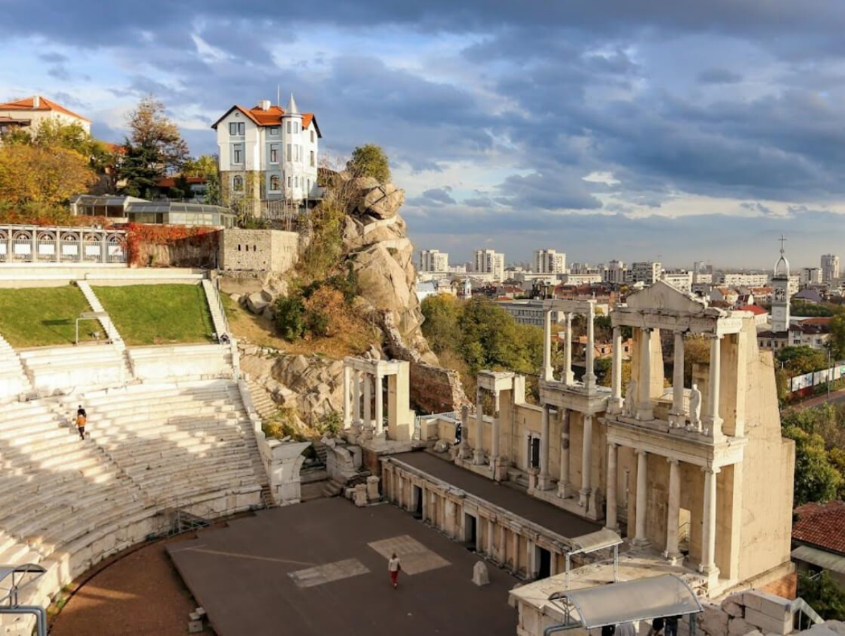
Kolodrum Plovdiv is the newest sports and entertainment jewel in the oldest living city in Europe - Plovdiv.

The city is one of the most popular tourist destinations in the country and a cultural and economic center of southern Bulgaria. There are many accommodation options here – from luxurious hotels to hostels.